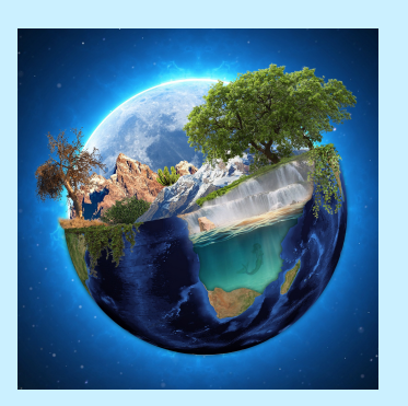
Saturday, April 26 9 a.m. – 3 p.m. Windsor Community United Methodist Church 9451 Brooks Rd S, Windsor, CA

This retreat, on the Saturday after Earth Day, is being organized by our task force and is open to everyone in the conference. In this time when there are assaults on all sides, we need to make space to connect with the Divine -- to be spiritually grounded -- as a daily first step toward works of love and justice. This retreat aims to help us "Thrive in Community" with one another and with God's Creation. We will gather in facilitated small groups for meditation, conversation, and the sharing of action and advocacy ideas. Come prepared for some time outdoors, weather permitting. Participants will also receive an orientation to the <u>Sacred Ground project</u> and a list of possible "field trips" for the journey home!